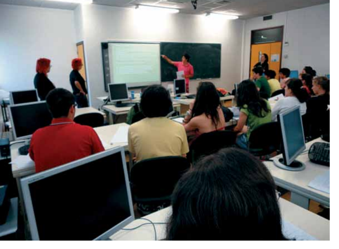
One moment of the mathematical Logic session

University of Porto. This activity, focused on the dvd "Symmetries" recently launched by Atractor, presented to students, in a playful and attractive way, the seventeen plane symmetry groups and seven frieze patterns. In the afternoon, the students went to Campus of Azurém, in Guimarães, which is the second campus of UM. There, they were able to observe the work developed in the area of robotics by scientists of UM, from the Departments of Industrial Electronics and of Mathematics and Applications. This trip to Guimarães finished with a visit to the town castle, the so-called birth place of Portugal.