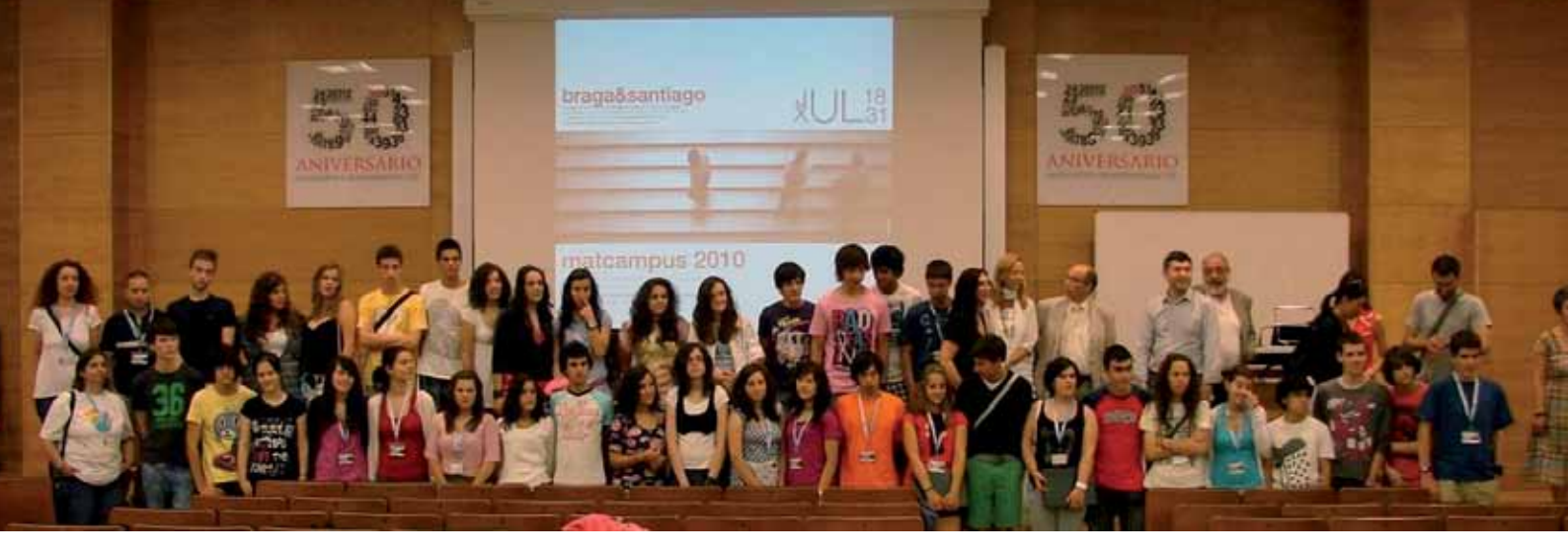
Group photo in Aula Magna, USC