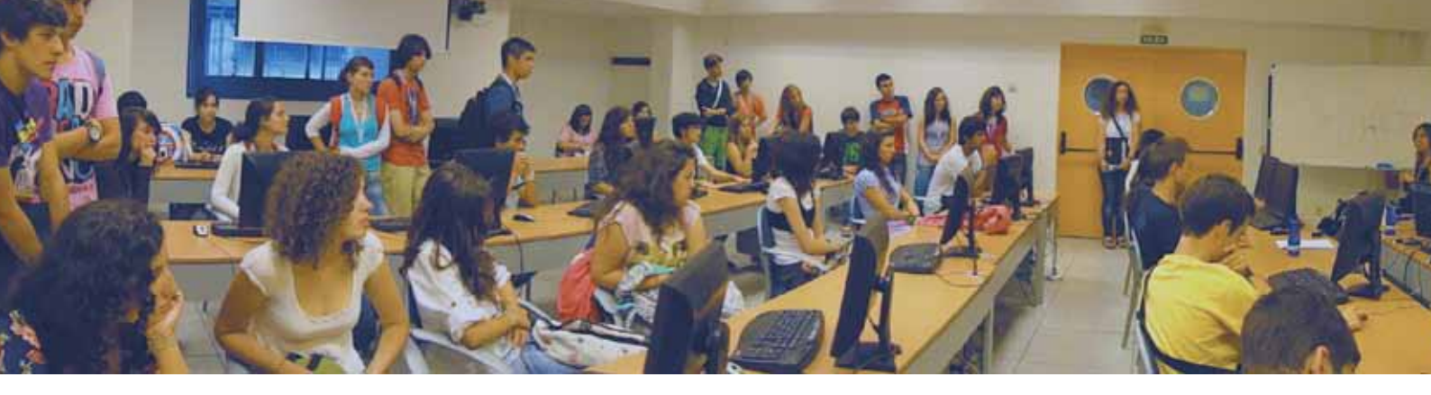
One of the classrooms where the students attended sessions

The officer in charge of the headquarters where the students stayed during the first week kindly offered the participants a pleasant afternoon, showing them the facilities, along with some military exercises and allowing each student to have a ride on their magnificent horses.