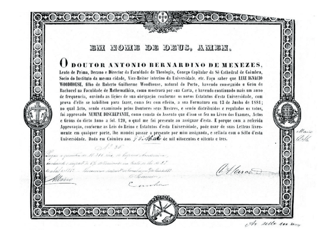
Figure 1.— Certificate of Woodhouse's degree.