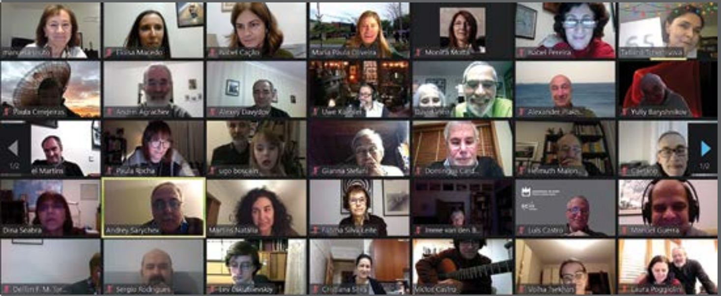
Screenshot of one of the moments of the event.